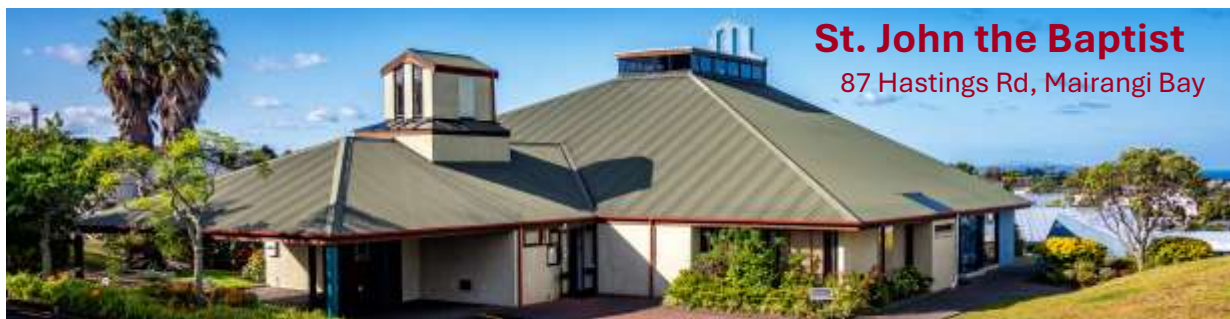
St. John the Baptist 87 Hastings Rd, Mairangi Bay