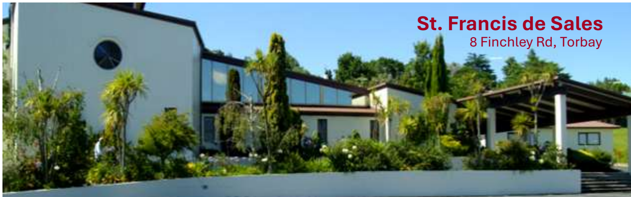
St. Francis de Sales 8 Finchley Rd, Torbay