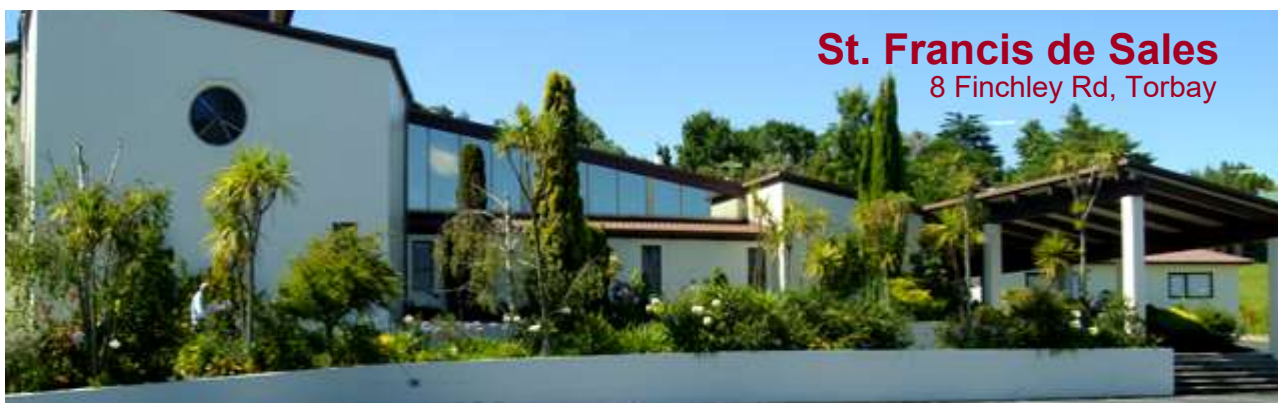
St. Francis de Sales 8 Finchley Rd, Torbay