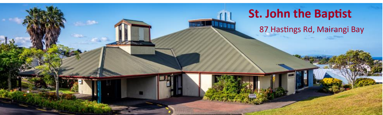
St. John the Baptist 87 Hastings Rd, Mairangi Bay

Celebration of the Feast of St John the Baptist