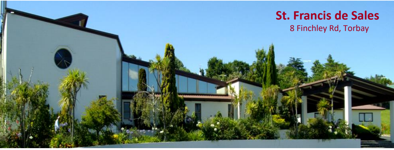
St. Francis de Sales 8 Finchley Rd, Torbay